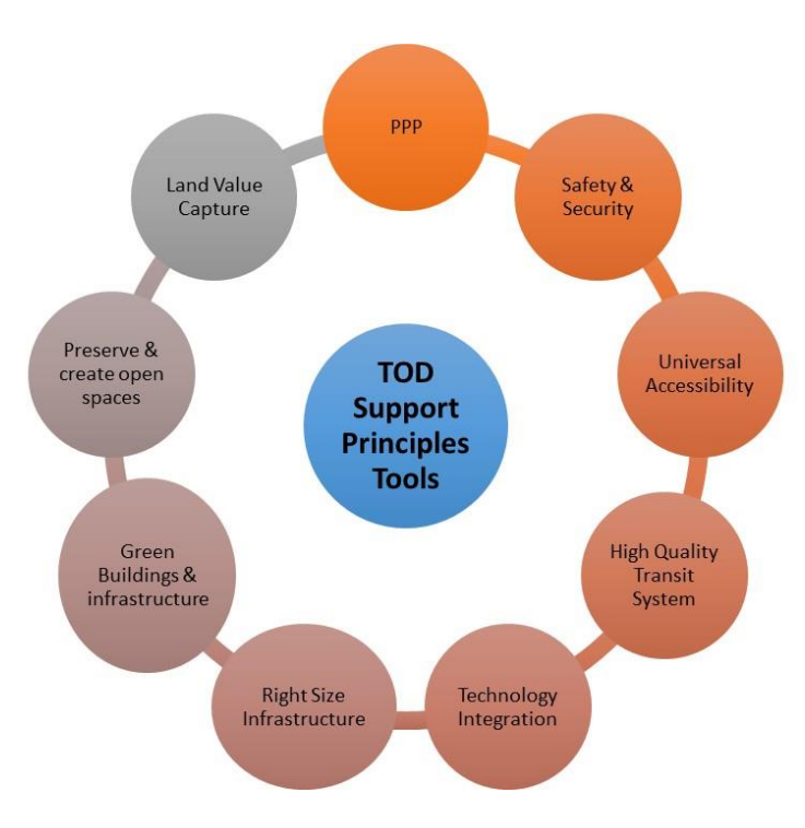
Figure 3: TOD Support Principles Tools