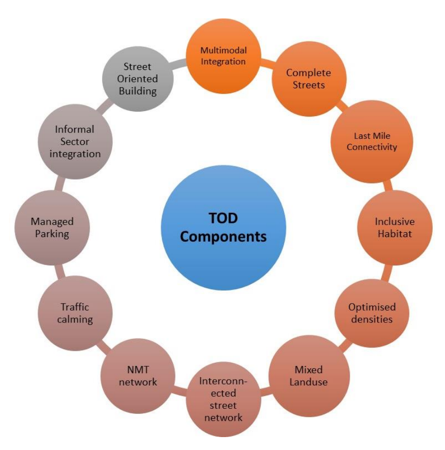
Figure 2: TOD Principles

TOD focuses on compact mixed use development around transit corridor such as metro rail, BRTS etc. International examples have demonstrated that though transit system facilitates transit oriented development, improving accessibility and creating walkable communities is equally important. Based on the objectives of National Urban Transport Policy, this TOD policy defines 12 Guiding Principles and 9 Supportive tools, as shown in Figure 2 and 3, for realizing the objectives of TOD.